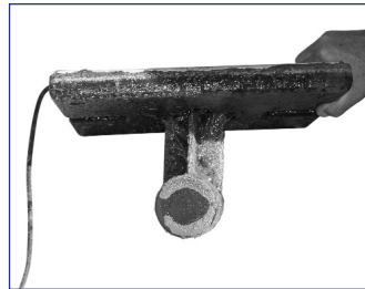
Before cleaning the face of the transducer

We recommend that at least every 30 days you unplug your SonicSolutions ® device, take it out of the water, wipe the face of the transducer off, put it back into the water and plug it back in.