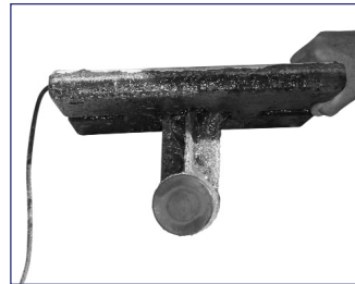
After cleaning the face of the transducer